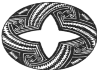
Pueblo pottery, 4-fold