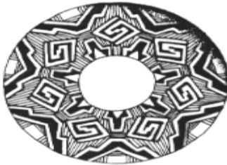
Pueblo pottery, 7-fold