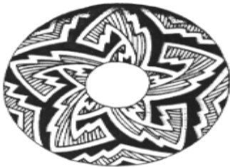
Pueblo pottery, 5-fold