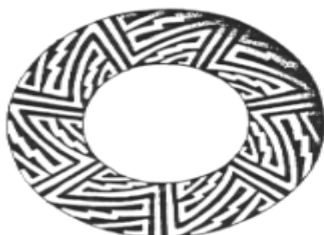
Pueblo pottery, 7-fold