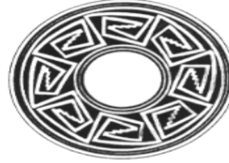
Mimbres pottery, 8-fold