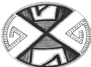
Pueblo pottery, 2-fold

Symmetrical - Symmetry is a design approach that makes opposite sides of something the same.