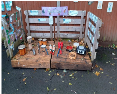
Music in Early Years

We have also had a company called Rock Steady in school who are going to help us form some bands- playing and tutoring guitar, keyboard, singing and drums. Even our teachers got involved. There is still time to sign up. Please see the link on the app if you are interested.