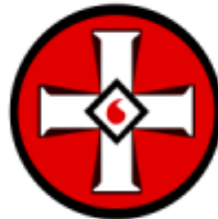
Ku Klux Klan