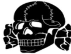
C18 Death's Head/ SS logo