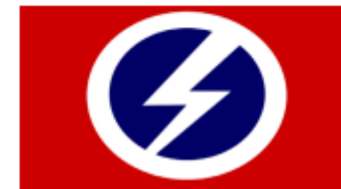
Fascist Logo Activate Windows Go to Settings to activate Win