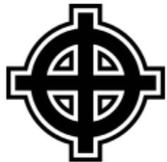
Racist Celtic Cross