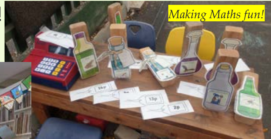
Making Maths fun!

Activities and Set-ups for every theme! E.g., Magic and Mystical Creatures!