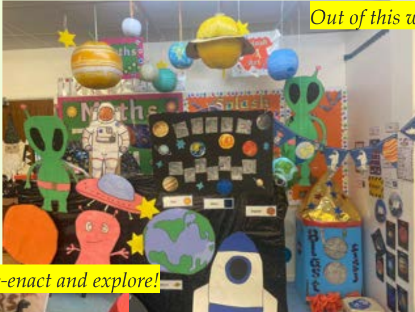
Out of this world role-plays