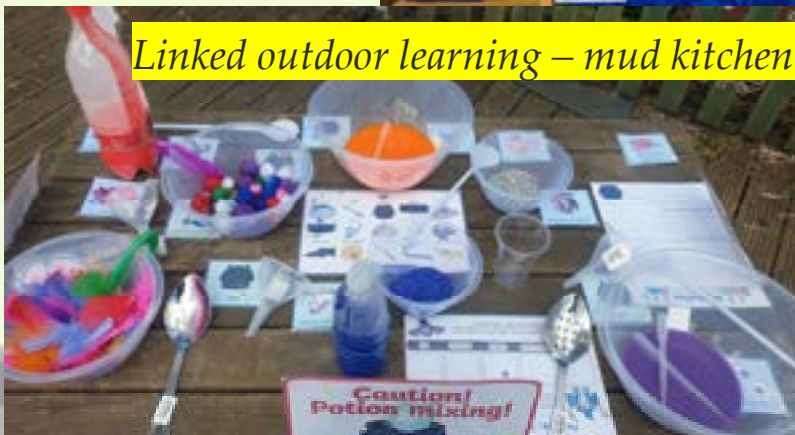
Linked outdoor learning – mud kitchen