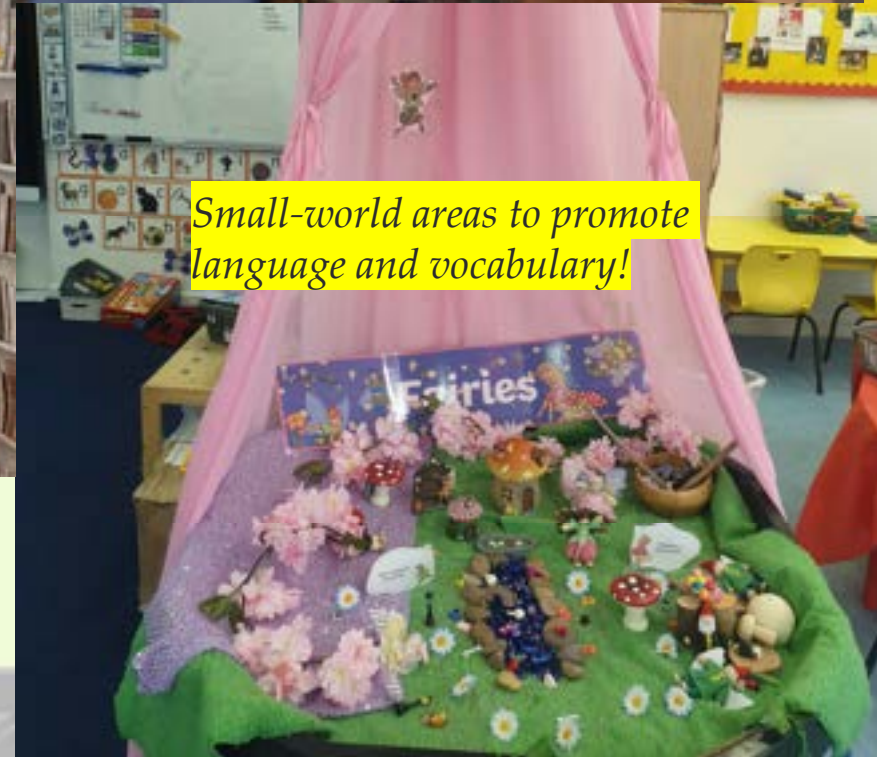
Small-world areas to promote language and vocabulary!