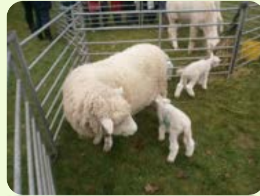
Farmer for a day!